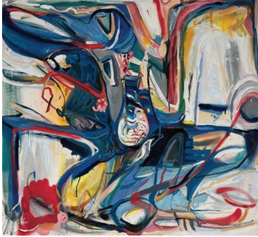
Center for Performing Arts – Box Office Gallery (and D Main Entrance - Atrium Gallery) Ann Blaas: Rampaging Down the Path Dates: January 21, 2025 – April 30, 2025

Join us for an art walk across campus to see FOUR Art on Campus Program exhibitions!