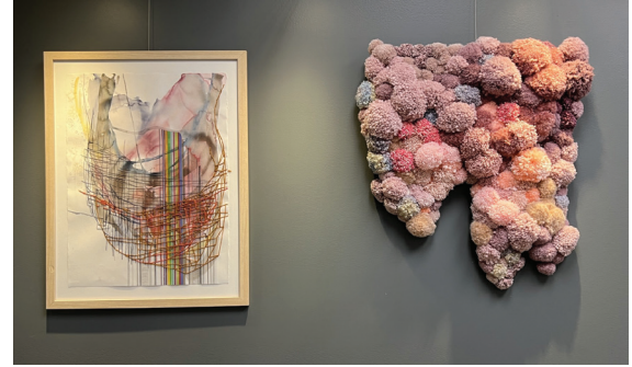
Library - Skylight Gallery Rita Grendze: Modulators Dates: January 21, 2025 – April 30, 2025